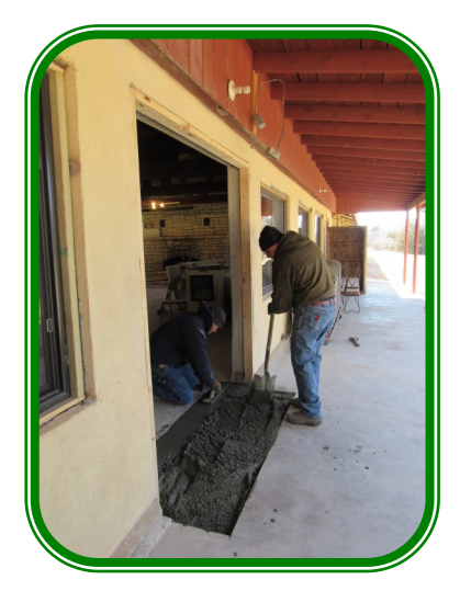
New double-door entrance to Dining Hall from west porch.