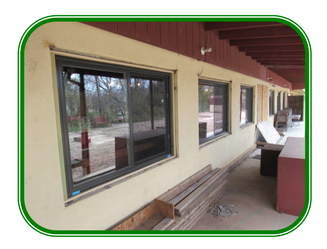
New Dining Hall west windows.