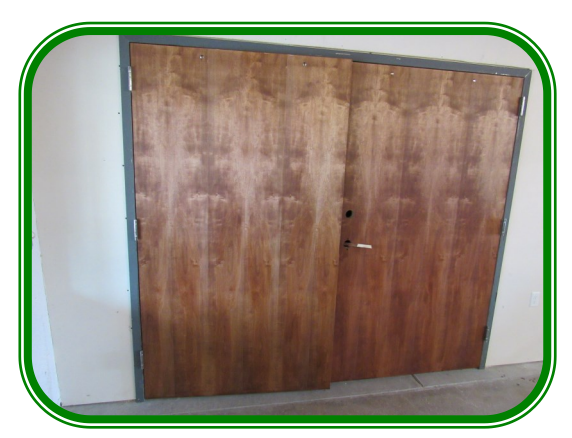
New Dining Hall storage room doors.

Over the winter, the next step of the dining hall renovation has been taking place. This means doors for the new storage area, and new windows and doors for the whole dining hall. Enjoy these pictures of the progress!